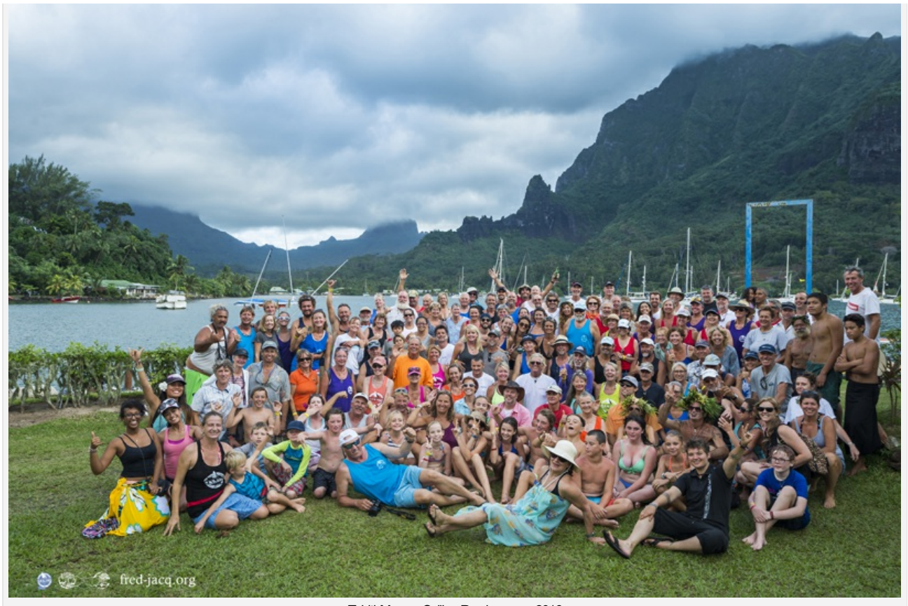
Tahiti-Moorea Sailing Rendez-vous 2016

Tags: boat, Catamaran, Hardstand, Haulout, maintenance, Marine, marine service centre, motor boat, New Zealand, Port, Port Whangarei, Port Whangarei Limited, port whangarei marine centre, refit, repair, sailing, Sailing Catamaran, Service, Storage, Superyacht, Travelift, vessel, Whangarei, yacht